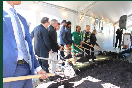
10/12: Black Cultural Center Grand Opening