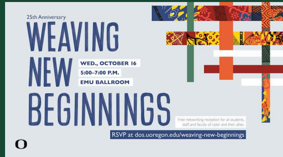
10/16: Weaving New Beginnings : A networking reception for students, faculty, and staff of color and their allies.