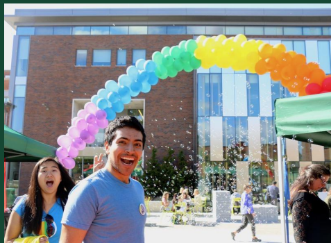
10/11: National Coming Out Day Festivities