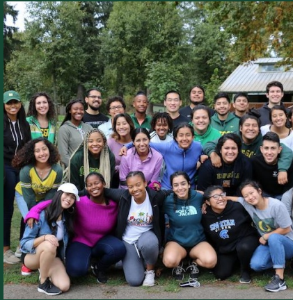
10/4 - 10/6: New Student Fall Retreat